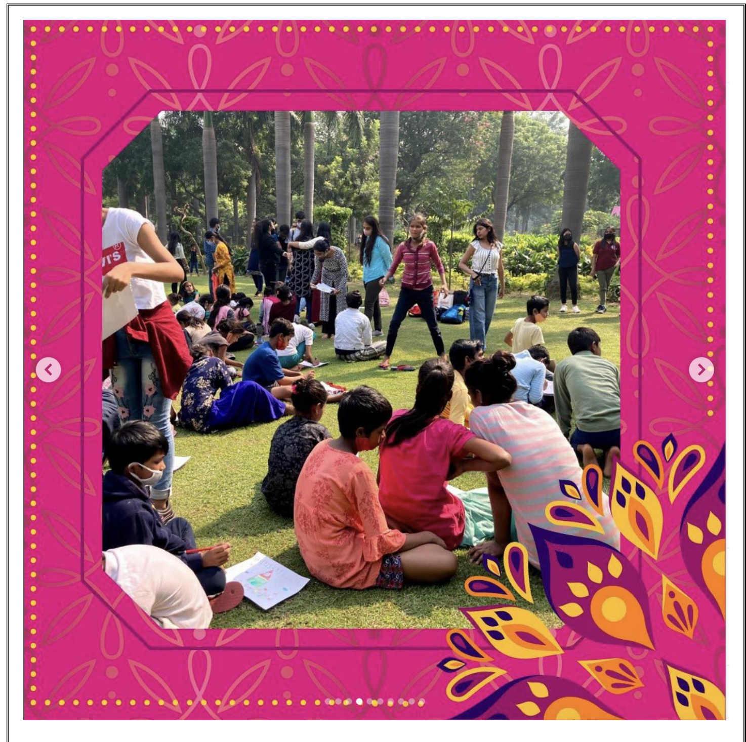
Kids of Sanjay Camp making posters